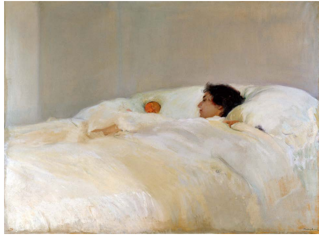
Madre , 1900. Joaquín Sorolla (1863-1923). Sorolla Museum, Madrid.

a representation of the domestic/female space is indicative of the general absence of a representation of the reality of the female in her own terms.