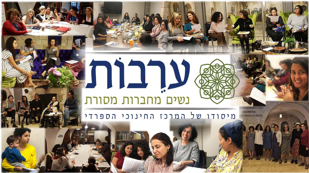
A collage by Sagy Watemberg from Arevot, with pictures of members and logo.

the conversations was Hebrew. All translations are mine.